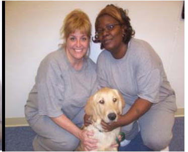
Inmate Primary Trainers: