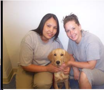
Inmate Primary Trainers: