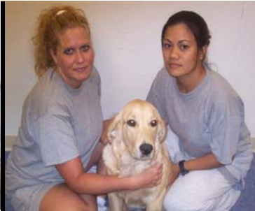
Inmate Primary Trainers: