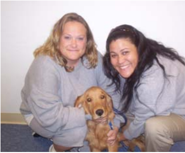
Inmate Primary Trainers: