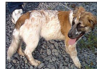
GENEVA SRTP's first-pooch!

Miss GENEVA is extra special because she was on “Puppy Death Row” and was just two days away from being euthanized at the Preston County Animal Shelter when she was selected for the paws4prisons™ Shelter/Rescue Training Program ( SRTP ). How lucky for us that GENEVA was released on “Puppy Parole” to our compound for rehabilitation, training, and eventual release.