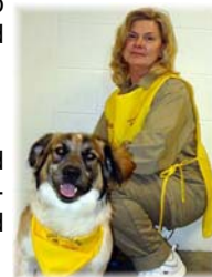
GENEVA'S Primary Trainer

GENEVA is currently scheduled for her private adoption on February 26, 2008.