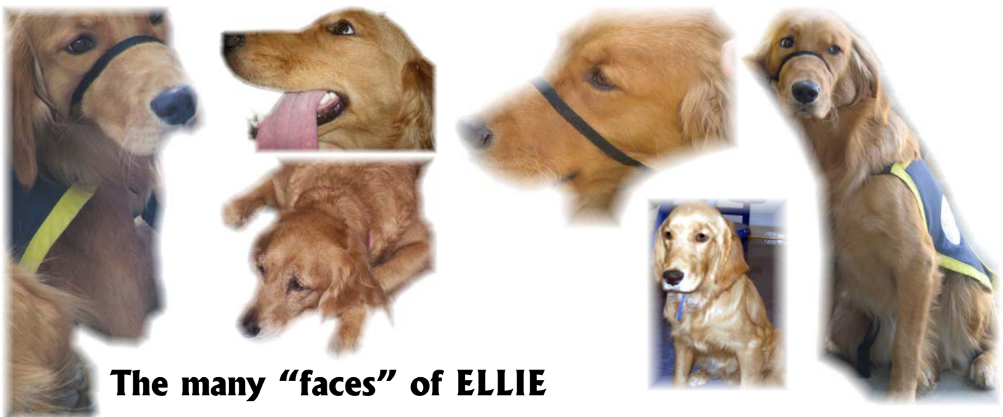
The many "faces" of ELLIE

Meeting the inmates was an incredible experience. As dynamic and inspiring as the paws4prisons™ volunteers are, the real stars behind the scenes are the ladies at USP Hazelton, striving to make a positive change and difference in their lives and those whom the dogs will help.